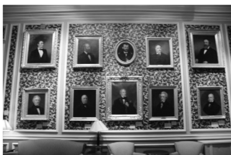
A wall of Presidents at the Union league

The Union League of Philadelphia provided a very special venue for the 278 guests at this year's Annual Dinner. In previous years, the reception hour was usually filled with lively chatter and old acquaintances catching up with each other; however, this year had a different feel. Many guests, who were visiting the Union League for the first time, took the opportunity to tour this remarkable facility which dates back to the 1860's, the same as the PDE. The evening was filled with wonderful food and great sounds, and was punctuated by a visit by