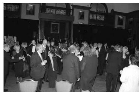
...and the dance floor was full all night long