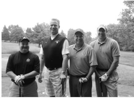
Spring Outing winners

The Scholarship Outing, which is historically held at the beautifully manicured and difficult Olde York Country Club in Chesterfield, NJ was won by the trio from Sharp