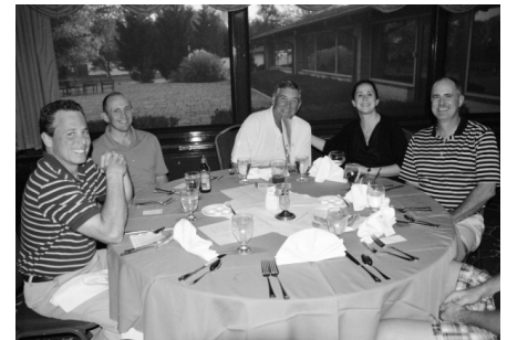
Fall Outing winning team